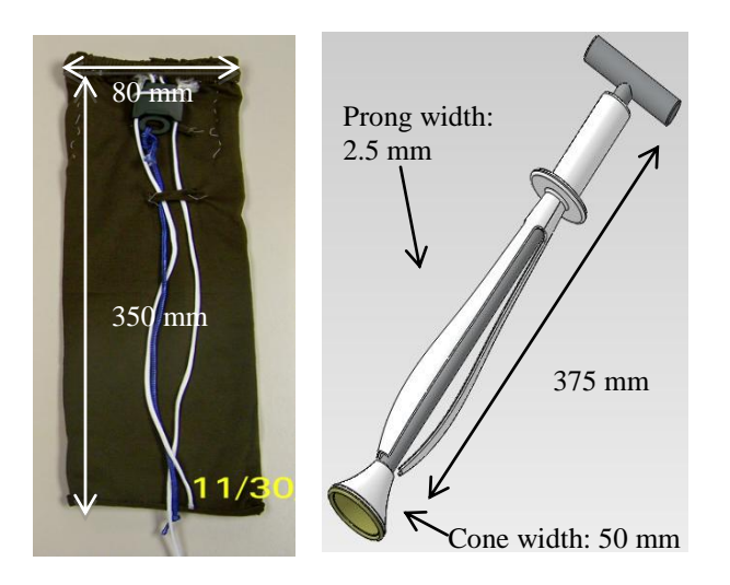
FIGURE 3 EXTRACTOR (LEFT) AND APPLICATOR (RIGHT)