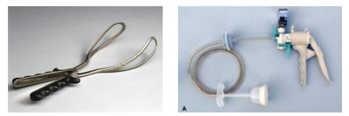
FIGURE 1 SIMPSON FORCEPS<sup>15</sup> (LEFT) AND MITYVAC VACUUM DEVICE<sup>16</sup> (RIGHT)

The Odon device (Figure 2), developed explicitly for resource-limited settings, is undergoing clinical trials in Argentina and South Africa. It has a disposable, folded sleeve of polyethylene that is applied to the head of the baby with a reusable bell-shaped inserter. A small amount of air is pumped into the inner sleeve, the inserter is removed, the sliding effect of the two sleeves creates an air lock, and traction is then applied to deliver the baby.